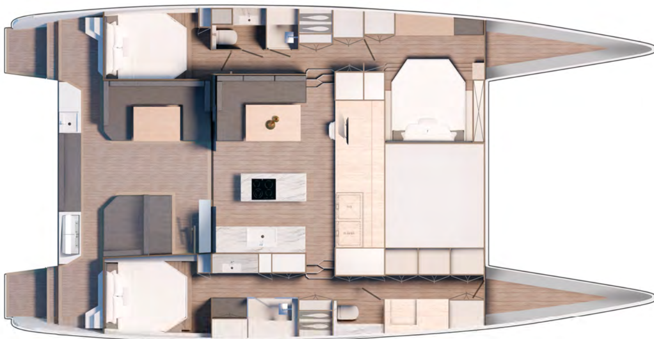
THREE CABIN INTERIOR