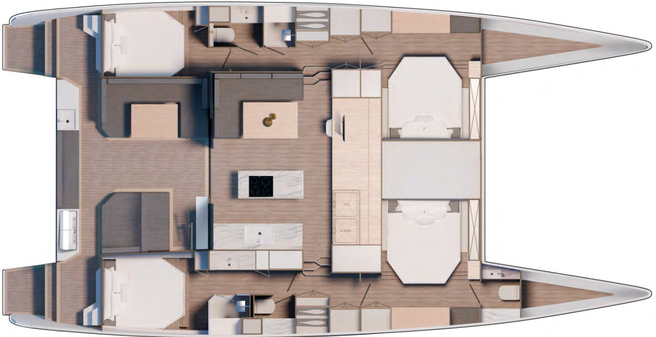
————— FOUR CABIN INTERIOR —————