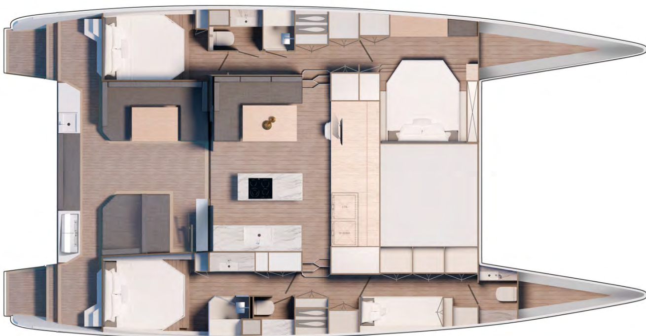
FOUR CABIN INTERIOR BUNK BEDS